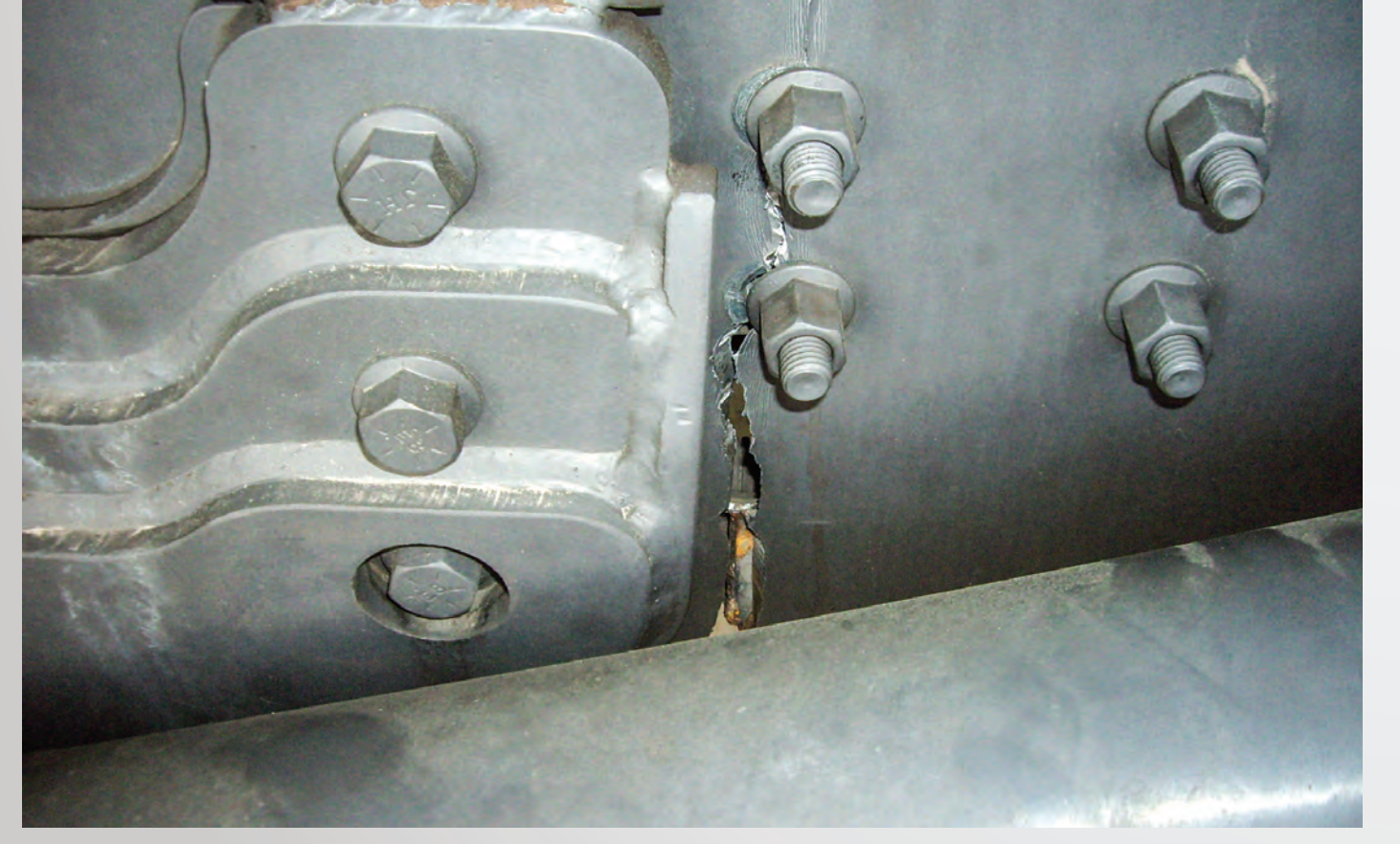
Image 1: Chassis rail cracking near to a lifting cylinder attachment mid-chassis on a tilting compactor

The strength of the chassis rail and sub-